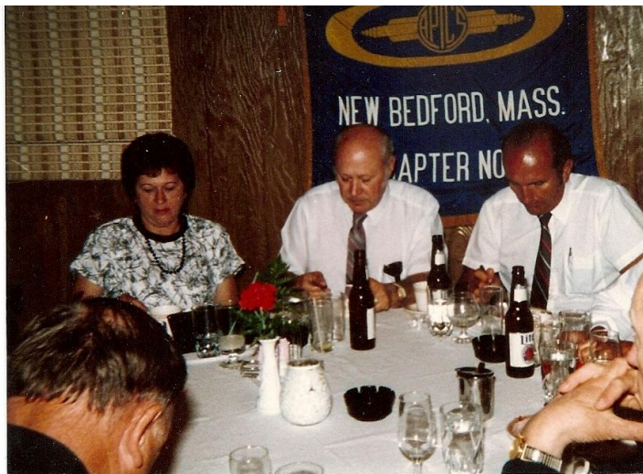
Some of our leaders during our proud 50 years.